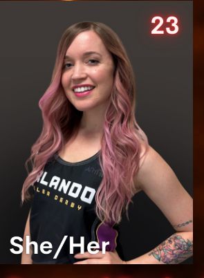
Buns of Teal