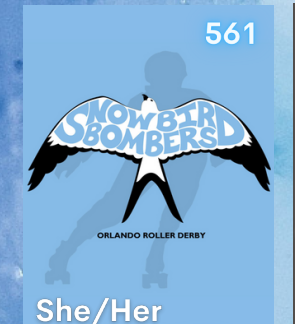
Beat Em' Up Beetle